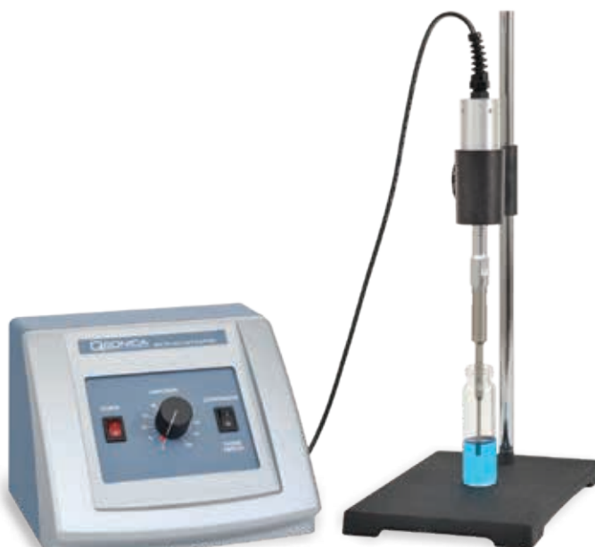
Stand sold separately.